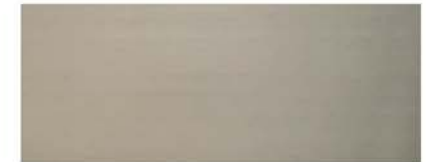
Bright hardened surface

Surface with slight oxide film without guarantee of a specific evenly colour