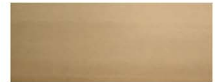
Yellow / Straw polished

Bright, polished surface, obtained by controlled tempering with liquid salt, applicable in different blue evenly colours/nuances