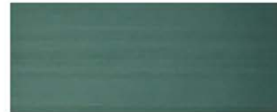
Scaleless Blue (Greyblue)

Surface with slight oxide film without guarantee of a specific evenly colour