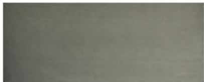
White polished surface (brush polished)

Matt bright surface finish with slight surface streaks (die scars)